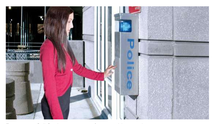
Emergency Call Stations ensure safety on widespread campus areas